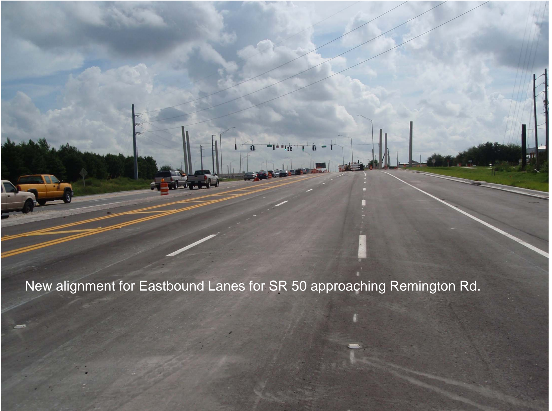
New alignment for Eastbound Lanes for SR 50 approaching Remington Rd.